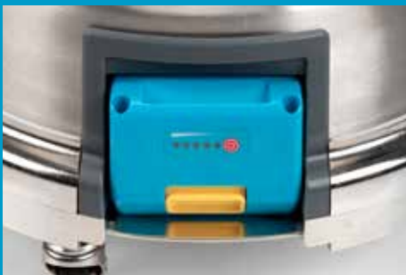
Battery powered machine