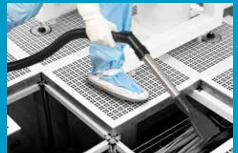
Special under floor hand tool included

For more info about our product, visit: i-teamglobal.com