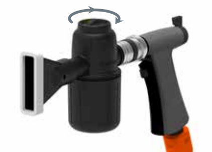
Integrated dosing. Just turn to adjust for the needed cleaning effect.