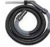
K.1.S.220107.2048 Kit assy hose 1.8 mtr 32 mm Black