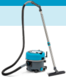
C06.I-V.1115S vac 6C 230V EU H/L 850W