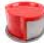
K.1.70.0168.1 Kit motor filter Hepa Red