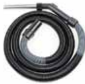
K.1.S.220107.2045 Kit assy hose 2.5 mtr 32mm Black