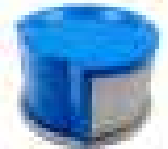
K.1.70.0168.701 Kit motor filter Ulpa Blue