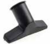
K.1.S.02.0031.5 Kit assy upholstery tool