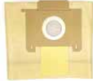
Kit paper bag 2L 1 bag included