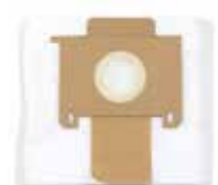
K.100.22.0094.831 Kit cloth bag 5L 100 pieces