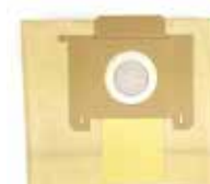
K.100.22.0094.830 Kit paper bag 2L 100 pieces