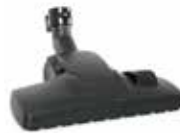
K.1.PAR.22.9045.266 Kit floor tool combi RD266 32mm w/t parking