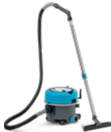
C06.I-V.1415S vac 6 230V AU H/L 850W