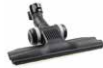
K.1.PAR.22.9045.610 Kit floor tool ergo w/t parking