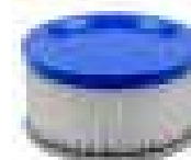
K.1.74.0168.701 Kit cartridge filter Ulpa Blue