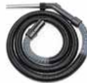
K.1.S.220107.2045 Kit assy hose 2.5 mtr 32mm Black