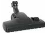
K.1.PAR.22.9045.297 Kit floor tool combi RD297 DK w/t parking