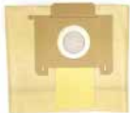
K.100.22.0094.80 Kit paper bag 2L 100 pieces