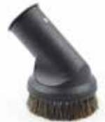
K.1.S.02.0040.5 Kit assy plumeau tool