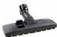
K.1.PAR.22.9045.8B Kit floor tool D272 DK w/t parking