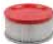
K.1.74.0168.1 Kit cartridge filter Hepa Red