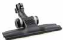
K.1.PAR.22.9045.610 Kit floor tool ergo w/t parking