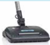
IBH.I-V.0000B i-brush 24V