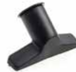
K.1.S.02.0031.5 Kit assy upholstery tool