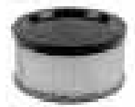
K.1.74.0168.0 Kit cartridge filter Black