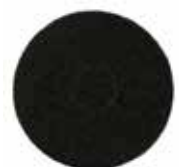
K.6.118.0074.0 Kit pad black 6 pieces