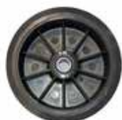
118.0032.0 Rear wheel