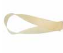
118.0028.0 Squeegee rubber front polyurethane