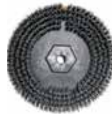
K.2.118.0107.0 Kit brush tynex 1.2 w/t fixation 1 set