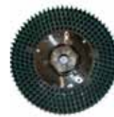
K.2.118.0072.0 Kit pad driver w/t fixation 1 set