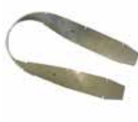
118.0027.0 Squeegee rubber front 1 pieces