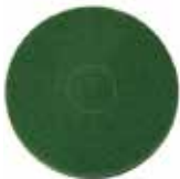
K.6.118.0074.6 Kit pad green 6 pieces