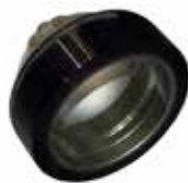
118.0065.0 Front wheel PU