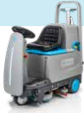
IDR.I-V.1100C i-drive 230V EU