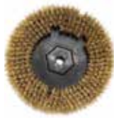
K.2.118.0106.0 Kit brush mischia 5 w/t fixation 1 set