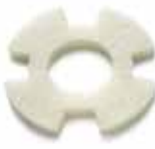
K.20.115.1057.2 White Light buffing & polishing.