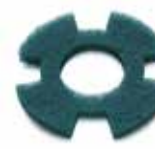
K.2.115.1060.64R Green Daily cleaning on stone, concrete, ceramic, vinyl, timber, rubber floors.