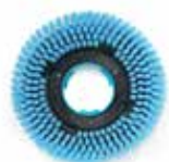
K.2.S.115.1054.70 Brush Lite Soft For light duty cleaning. Use on timber and delicate floors.