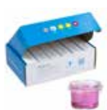
K.120.72.0444.111 i-dose 3 Sanitary Pink