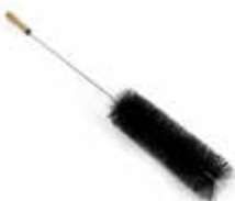
K.1.72.0324.0 Cleaning brush For imop dirt tank.