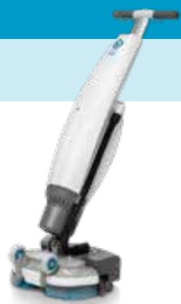
IMOPLT.FCT.1100C imop Lite Includes standard medium brush, squeegee and rubber wheels.