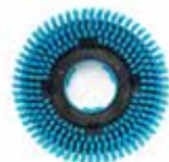
K.2.S.115.1054.797 Brush Lite Medium For everyday scrubbing and cleaning. Standard supplied with i-mop.