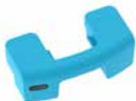
S.115.0248.797 i-power 12 battery