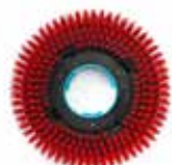
K.2.S.115.1054.1 Brush Lite Hard For use with deep cleaning including grout lines.