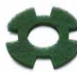
K.20.115.1057.64 Green Aggressive scrubbing pad, unsealed floors.