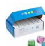
K.120.72.0444.0 i-dose 3/5/7 Mixed