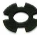
K.20.115.1057.0 Black Very aggressive scrubbing and stripping.