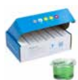
K.120.72.0444.6 i-dose 7 Degrease Green