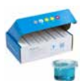
K.120.72.0444.7 i-dose 5 Daily Blue