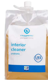
i.51 interior cleaner probiotic K.4.I51.PO.1800 360 doses