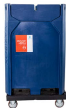
200L varibox K.1.IQ10.VB.200000