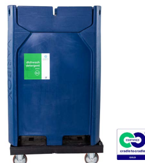
200L varibox K.1.IQ4.VB.200000