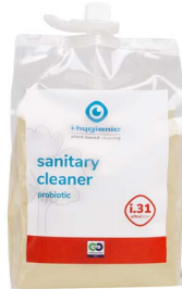
i.31 sanitary cleaner probiotic K.4.I31.PO.1800 360 doses