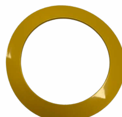
Color ring K.1.IH.RG.Y