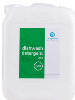
10L can K.1.IQ5.CA.10000