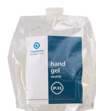
iP.31 hand gel alcohol K.6.I31.PO.800