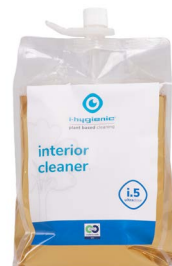
i.5 interior cleaner K.4.I5.PO.1800 360 doses