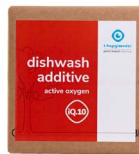
10L safe box K.1.IQ10.BB.10000