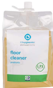
i.71 floor cleaner probiotic K.4.I71.PO.1800 360 doses