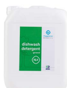
10L can K.1.IQ3.CA.10000