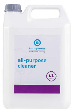
5L can K.2.I1.CA.5000

flexdose flexdose ultra* portable manual dosing