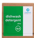
10L safe box K.1.IQ5.BB.10000