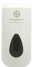
Dispenser spray disinfection K.1.IH.DI.DS