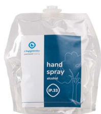
iP.33 hand spray alcohol K.6.I33.PO.800