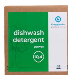
10L safe box K.1.IQ4.BB.10000