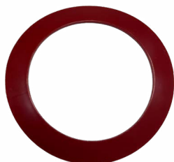
Color ring K.1.IH.RG.R

The refill station K.1.IH.RS is supplied with a standard gray ring. Optional rings are available in red (sanitary), blue (interior), green (floor), and yellow (kitchen). This makes it easy to identify which cleaner is in which dispenser.