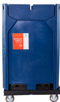
20L varibox K.1.IQ10.VB.200000