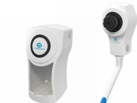
Dispenser set K.1.IH.ES.BUS