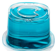
10ml pod K.120.72.0444.7