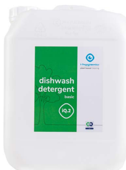
10L can K.1.IQ2.CA.10000