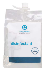
i.12 disinfectant K.4.I12.PO.1800 360 doses