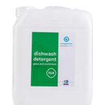
10L can K.1.IQ6.CA.10000