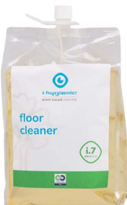
i.7 floor cleaner K.4.I7.PO.1800 360 doses