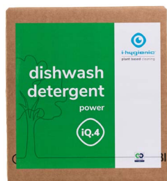
10L safe box K.1.IQ4.BB.10000

autodose ultra automatic dispenser dosing