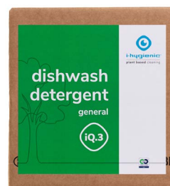
10L safe box K.1.IQ3.BB.10000

autodose ultra automatic dispenser dosing