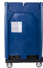
200L varibox K.1.IQ7.VB.200000