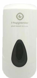
Dispenser foam soap K.1.IH.DI.FS