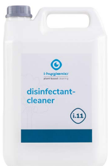
5L can K.2.I11.CA.5000