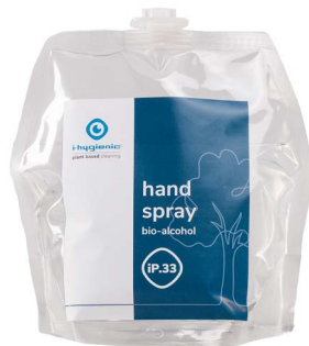
800ml pouch K.6.I33.PO.800