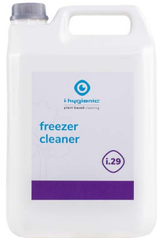
5L can K.2.I29.CA.5000