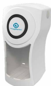
Refill station K.1.IH.RS

The number of dispensers required must be ordered separately. Max 4 to connect.