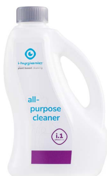
2L dispensing bottle K.6.I1.DB.2000 *