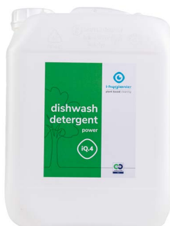
10L can K.1.IQ4.CA.10000.A