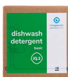
10L safe box K.1.IQ2.BB.10000