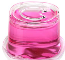
10ml pod K.120.72.0444.111