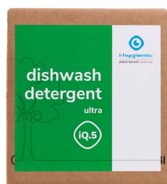
10L safe box K.1.IQ5.BB.10000

autodose ultra automatic dispenser dosing