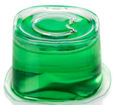
10ml pod K.120.72.0444.6