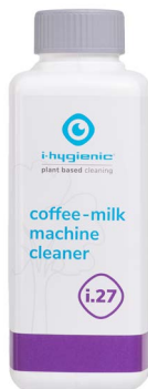
1L dispensing bottle K.6.I27.DB.1000