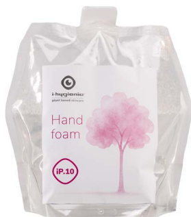
800ml pouch K.6.IP10.PO.800