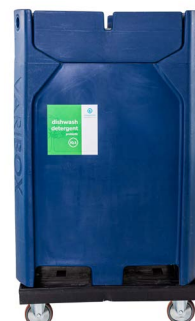
200L varibox K.1.IQ1.VB.200000