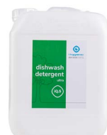
20L can K.1.IQ5.CA.20000