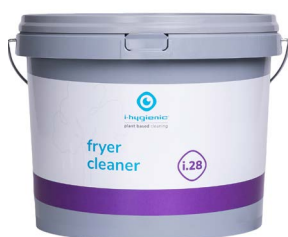
5KG bucket K.2.I28.BU.5000