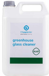
5L can K.2.IG87.CA.5000