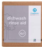
10L safe box K.1.IQ7.BB.10000