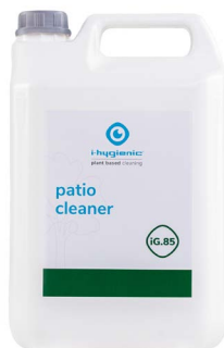
5L can K.2.IG85.CA.5000