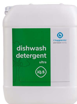
20L can K.1.IQ5.CA.20000