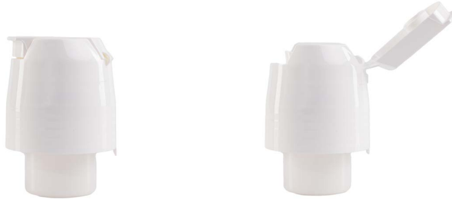
dosing cap 5 ml K.6.IH.DC.5