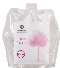
iP.10 hand foam K.6.IP10.PO.800