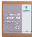
10L safe box K.1.IQ8.BB.10000