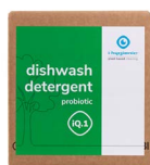
10L safe box K.1.IQ1.BB.10000