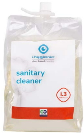
i.3 sanitary cleaner K.4.I3.PO.1800 360 doses