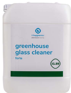
20L can K.1.IG89.CA.20000