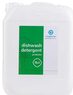
10L can K.1.IQ1.CA.10000