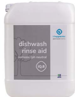
20L can K.1.IQ8.CA.20000