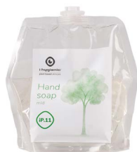
iP.11 hand soap mild K.6.IP11.PO.800