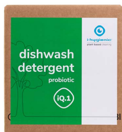
10L safe box K.1.IQ1.BB.10000

autodose ultra automatic dispenser dosing