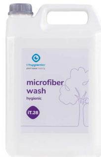
5L can K.2.IT28.CA.5000