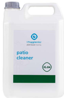
5L can K.2.IG84.CA.5000