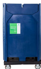
200L varibox K.1.IQ1.VB.200000