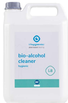
5L can K.2.I8.CA.5000