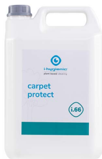
5L can K.2.I66.CA.5000