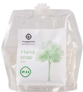
800ml pouch K.6.IP11.PO.800