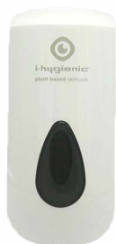
Dispenser liquid soap K.1.IH.DI.LS

Delivers consistent dosing and optimal hygiene, suitable for liquid soap, foam soap or spray disinfection.