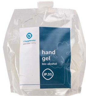
800ml pouch K.6.I31.PO.800