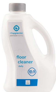
2L dispensing bottle K.6.ID5.DB.2000 400 doses