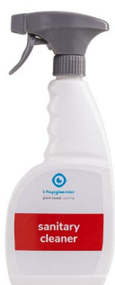
sanitary cleaner refill 750ml spray bottle K.6.I3.SB.REF