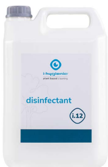
5L can K.2.I12.CA.5000