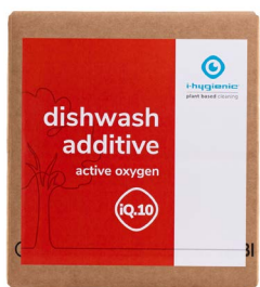
10L safe box K.1.IQ10.BB.10000

autodose ultra automatic dispenser dosing