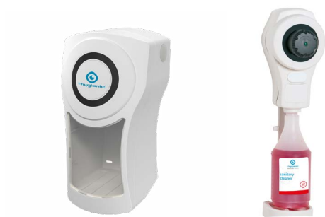
Dispenser set K.1.IH.ES.SB