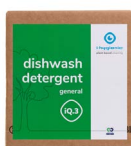
10L safe box K.1.IQ3.BB.10000