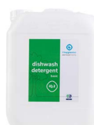
10L can K.1.IQ2.CA.10000