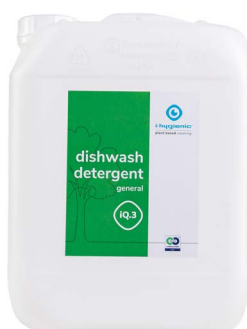
10L can K.1.IQ3.CA.10000.A