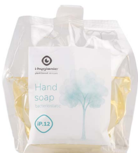
800ml pouch K.6.IP12.PO.800