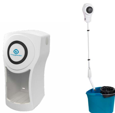
Dispenser set K.1.IH.ES.BUL