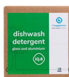
10L safe box K.1.IQ6.BB.10000