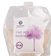
iP.20 hair and body wash K.6.IP20.PO.800