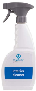
interior cleaner refill 750ml spray bottle K.6.I5.SB.REF