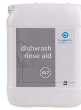
20L can K.1.IQ7.CA.20000