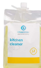
i.2 kitchen cleaner K.4.I2.PO.1800 360 doses