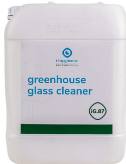
20L can K.1.IG87.CA.20000