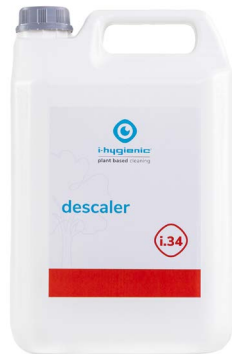
5L can K.2.I34.CA.5000