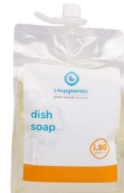
i.80 dish soap K.4.I80.PO.1800 360 doses