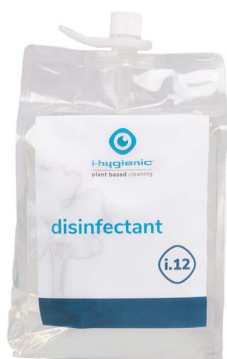
1,8L pouch K.4.I12.PO.1800

autodose ultra automatic dispenser dosing