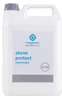
5L can K.2.IG88.CA.5000