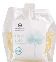
iP.12 hand soap bacteriostatic K.6.IP12.PO.800