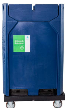
200L varibox K.1.IQ5.VB.200000