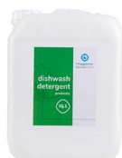
10L can K.1.IQ1.CA.10000