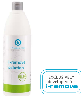
1L application bottle K.12.106.0143.0/H