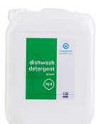
10L can K.1.IQ4.CA.10000