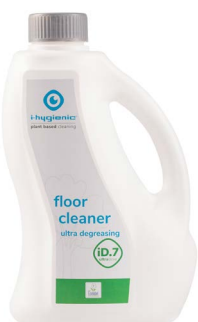
2L dispensing bottle K.6.ID7.DB.2000 400 doses