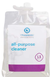
1,8L pouch K.4.I1.PO.1800

autodose ultra automatic dispenser dosing