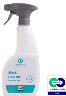
750ml spray bottle K.6.I19.SB.750