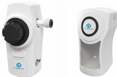
Dispenser set K.1.IH.EM.BU