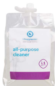
i.1 all-purpose cleaner K.4.I1.PO.1800 360 doses