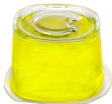
10ml pod K.120.72.0444.8