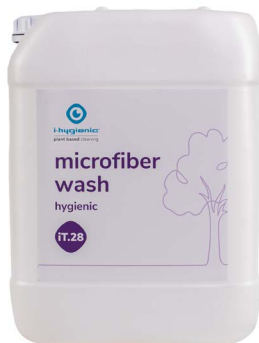
20L can K.1.IT28.CA.20000