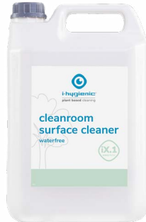
5L can K.1.IX1.CA.5000