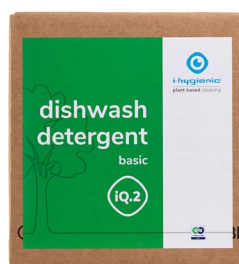
10L safe box K.1.IQ2.BB.10000

autodose ultra automatic dispenser dosing