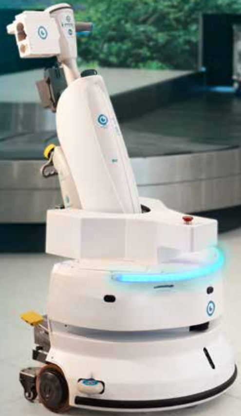
the i-mop XL is not included.

Maximize cleaning efficiency without wasting time. Combine powerful, modern co-botic technology with the unequaled cleaning results of an i-mop XL. In less than a minute, you can get the machine operational and get on with other tasks.